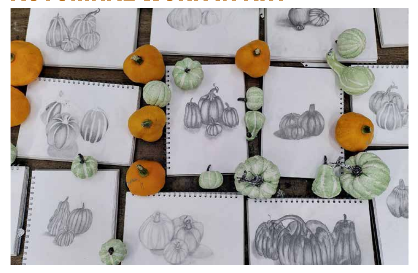
Year 10 students at Wellsway School have been getting into the autumn season by drawing pumpkins. This has helped build up skills in preparation for coursework and they have produced some fantastic drawings.